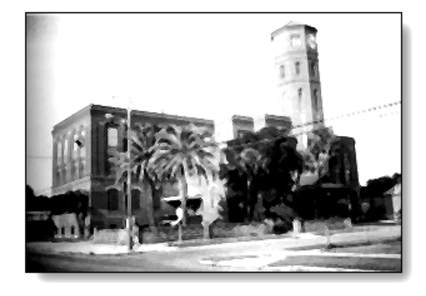
Regensburg Cigar Factory West Tampa

By the time West Tampa was established as a separate city in May 18, 1895, the rapid growth of this municipality brought on great expectations.